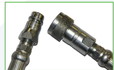
Three sets of Quick Connects, with dust caps, are included.